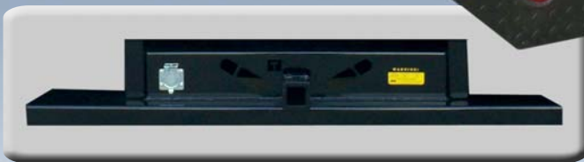
10,000# Receiver Hitch / ICC Bumper