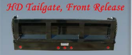
HD Tailgate, Front Release