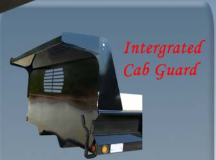
Intergrated Cab Guard